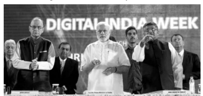
PM, FM and MOC sorrunded with udyog Jagat personnel but Govt. PSU, BSNL, however in the function

The mega event of 1st July tends to believe